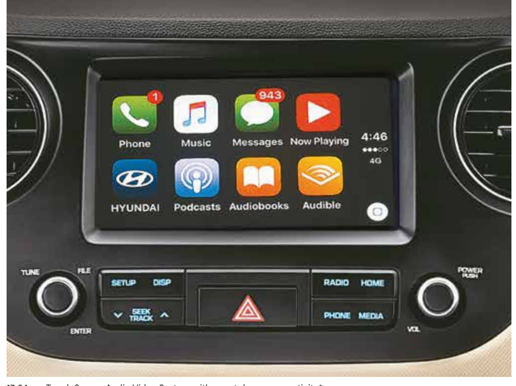
17.64 cm Touch Screen Audio Video System with smartphone connectivity*

The GRAND i10 offers assistive technology at its very best with a class-leading 17.64 cm Touch Screen Audio Video System with smartphone connectivity, voice recognition and navigation support.