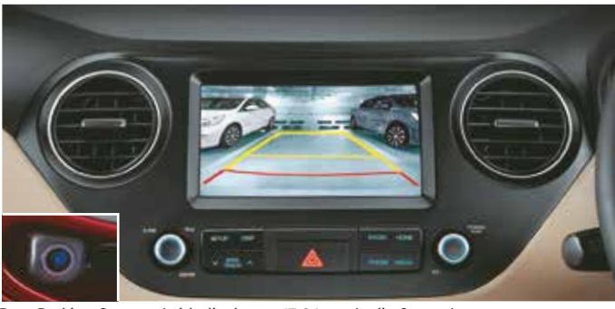
Rear Parking Camera (with display on 17.64 cm Audio Screen)