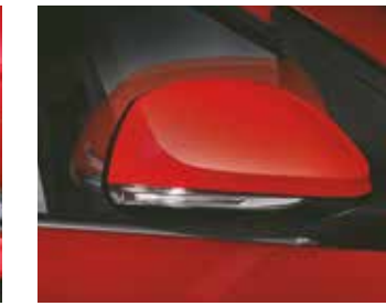
Electric Folding ORVM with Turn Indicators