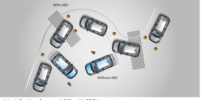
Anti-lock Braking System (ABS) with EBD^