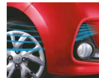
Front Air Curtains