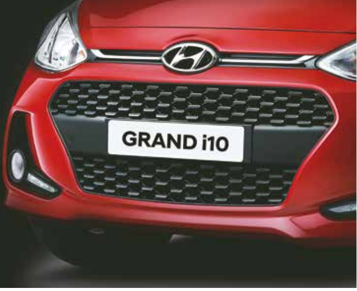
Cascade Design Grille - Bold New Design Identity