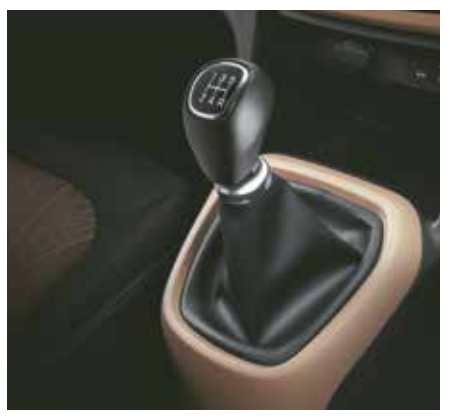
5-speed Manual Transmission

Experience power like never before with the state-of-the-art petrol engine of the GRAND i10.