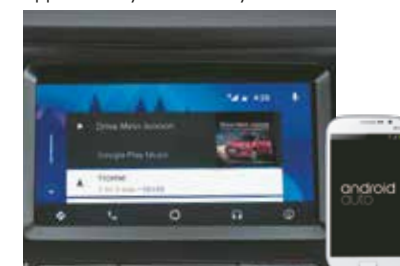
Android Auto Connectivity