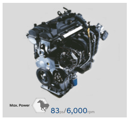
1.2l Kappa Dual VTVT Petrol Engine (Also Available with CNG)