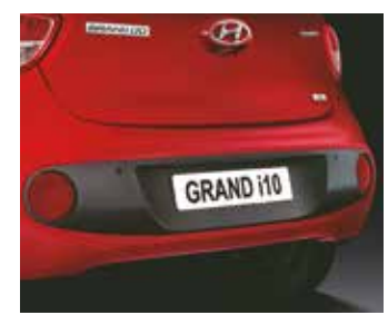
Dual Tone Rear Bumper